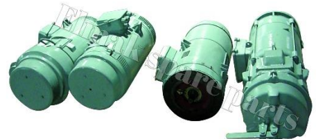
70/55/45RCS, 33PC /25PC motor