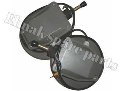
Weather van block