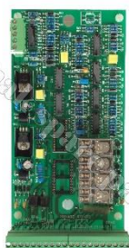
RCV Block V-61406-51