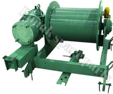
40PC/33PC Hoist winch