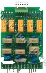
RCV Block M -61406 -43