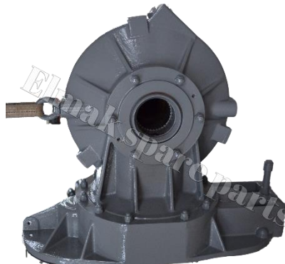
Bevel reduction gear