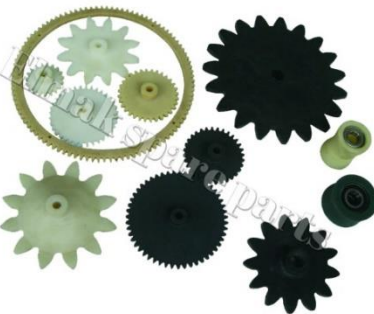
Nylon Pinion for limit switch