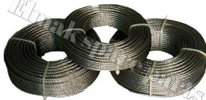
Thermistor temperature monitor