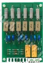
RCV Block X-14406-72