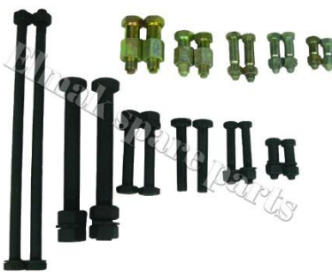
Bolts & pins