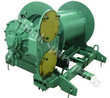
70 RCS Hoist winch