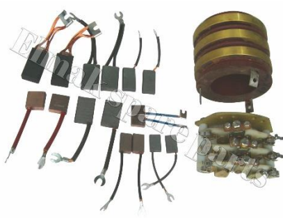
Brush holder slipper ring