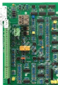
RCV Block B-61406-33